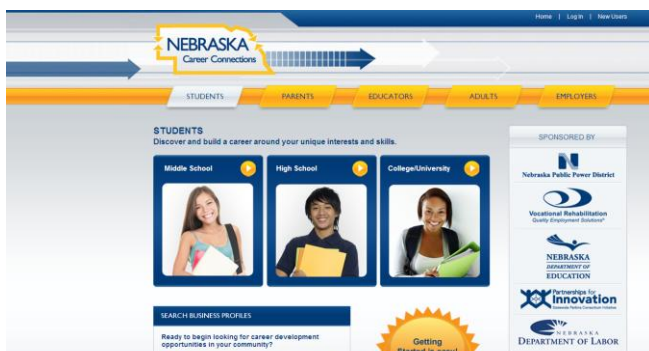
New student portal page.