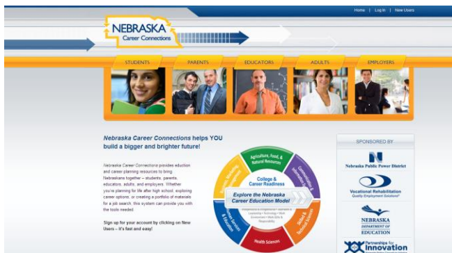
New Nebraska Career Connections Portal Page